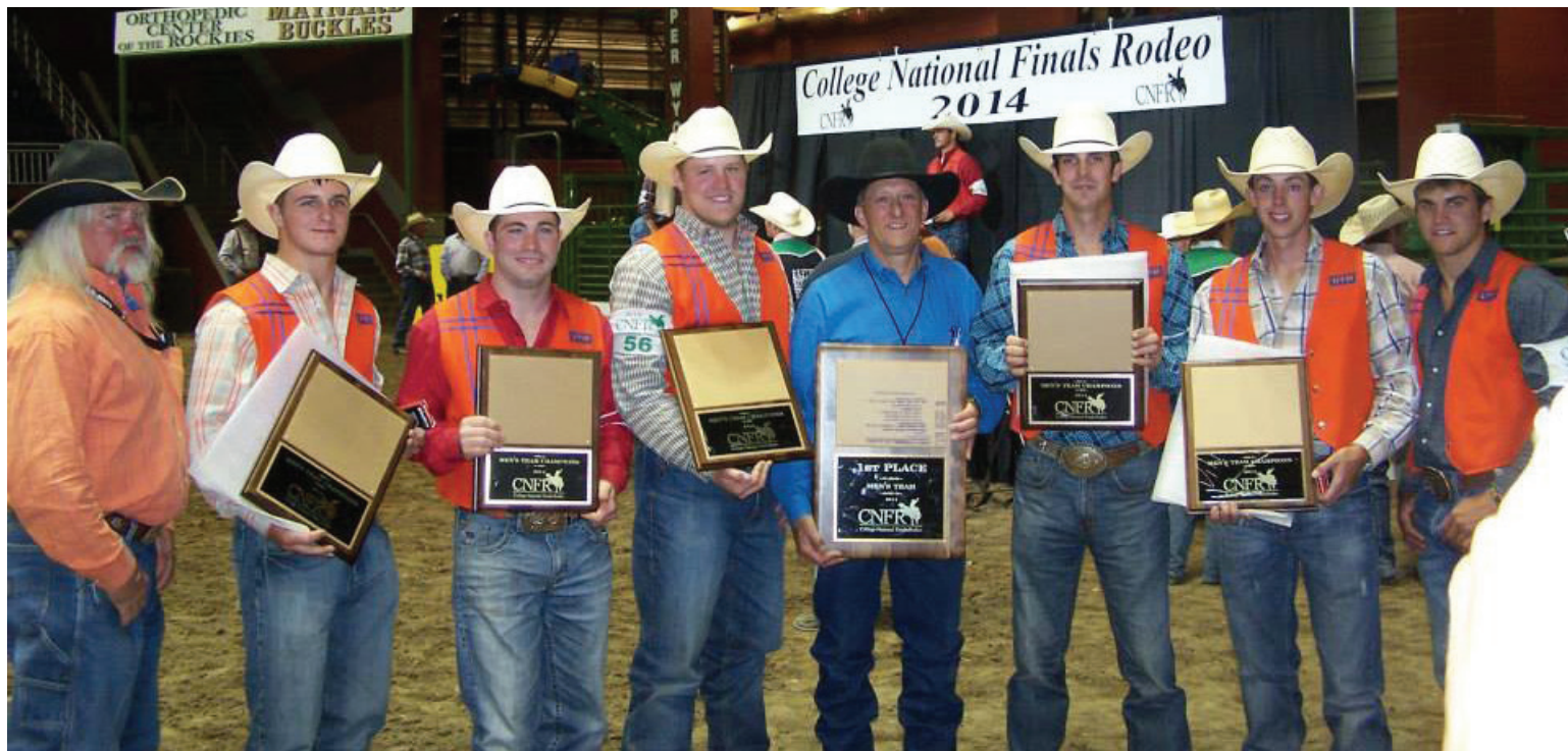
The national champs and their first place plaques.