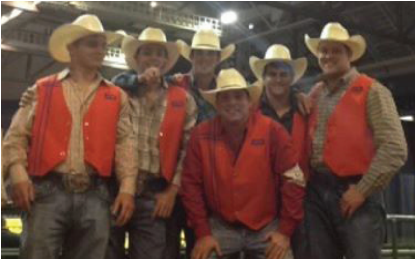
National Champs on the bucking chutes at the CNFR!